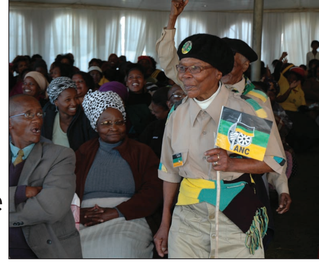
Makana Freedom Festival: Elderly Struggle Veterans March Forward